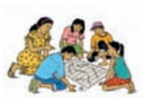
Participation Section 2

Accountability can be seen as having 5 dimensions: