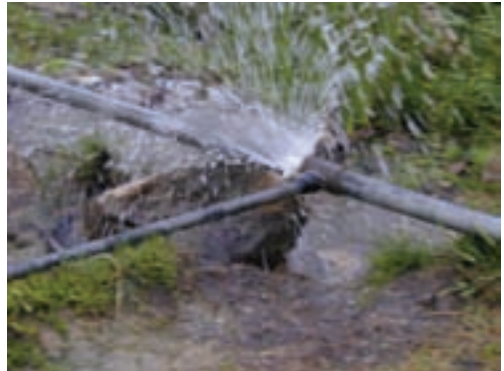
East Timor. Illegal Connections.