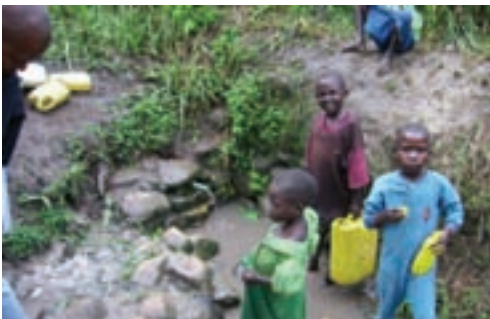
Children collecting water.