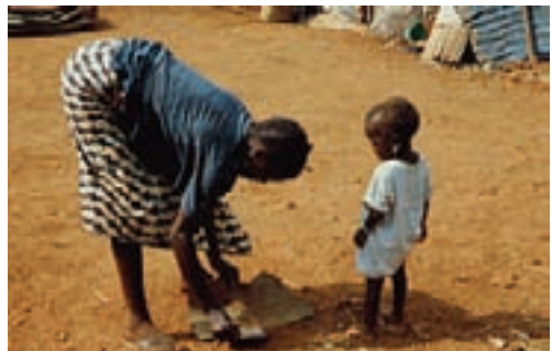
Sierra Leone, IDP camps.