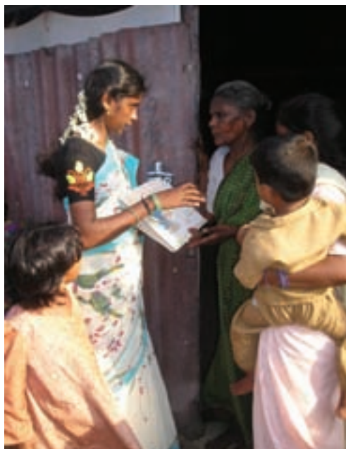
Home visiting