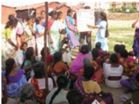
Tsunami Response.