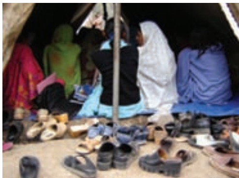
Community Meeting.