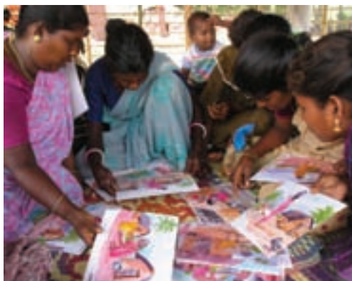
Three pile sorting.

During the response to Cyclone Sidr in Bangladesh, an inventive engineer came up with a useful way to help to manage and resolve complaints. The selection criteria for the provision of shelter was determined in partnership with community groups in order to determine where the priorities were. Photographs were taken of the shelters to be repaired. Several families subsequently complained that they should also have had shelters provided for them. A picture was then taken of their shelter and compared to the shelters of the families that had been selected and this helped to provide both community members and the construction team with a useful way to resolve any differences. (OXFAM personal Communication)