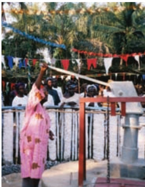
Well opening Sierra Leone.

It should also be remembered that older people have a wealth of experience and knowledge about their communities and can make a significant contribution in both preparing and responding to emergencies: so consideration and thought needs to be given in how to responsibly contact and interact with older people.