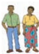
Staff Competencies and Attitudes Section 6