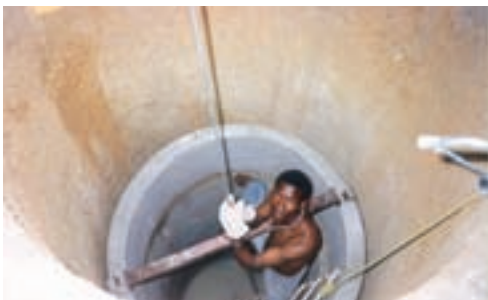
Well construction.