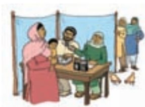
Transparency Section 3