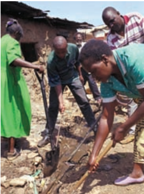
Digging drainage channels.

As part of its Tsunami response programme, HelpAge has produced a detailed social map of all the villages in which it works. Data, collected through village surveys and individual interviews, is represented visually in a series of maps available on CD-Rom. The maps show each house, the type of house (brick, thatch), houses with older people, houses in receipt of programme support and type of activity (e.g. livestock, artisan). Clicking on individual houses gives details of the older person living in that house, including information on health issues. Each social map is available at village level on a 12 x 8 foot canvas. (This idea could be adapted for the WASH sector.)