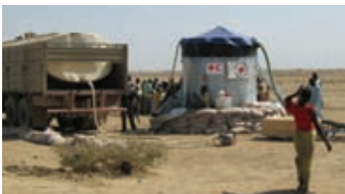
Water treatment and distribution.