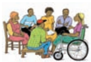
Monitoring and Evaluation Section 5