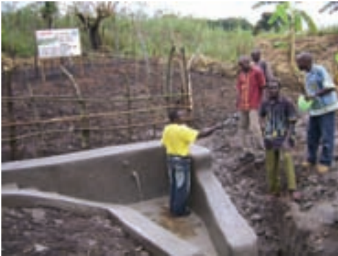
Spring Protection.

www.wsp.org/UserFiles/file/327200744509_saybetter.pdf