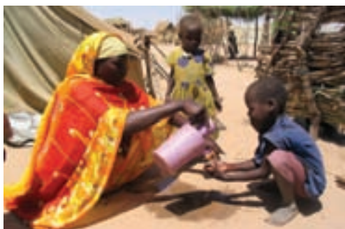
Sudan, Darfur Camp

The community elects volunteers who visit the houses to verify if the house still deserves the award and/or if there are new houses that can fly the green flag. It is hoped that in the future, the community will determine the criteria for a model household. Mapping those households with green flags can be a useful community exercise and can trigger a lot of debate and discussion. ( Oxfam Accountability Case study: 2008 Southern Sudan; Community Participation in Monitoring ).