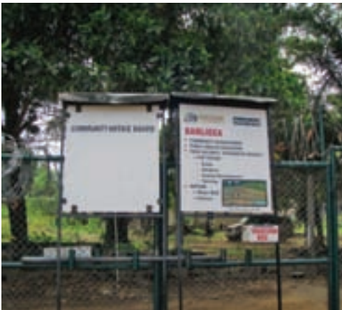
Information board in Liberia.

Communities initially used the ledgers as guest books to record visitors to the community. This made sure that other NGOs were not duplicating efforts but later the communities were trained to use the ledgers to record the movements of project materials. The Committee made sure that any request for materials from project staff details the quantities, output and staff names. This helps to ensure that materials are used for their intended purpose. (Tearfund 2009 personal communication)