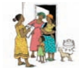
Feedback and Complaints Section 4