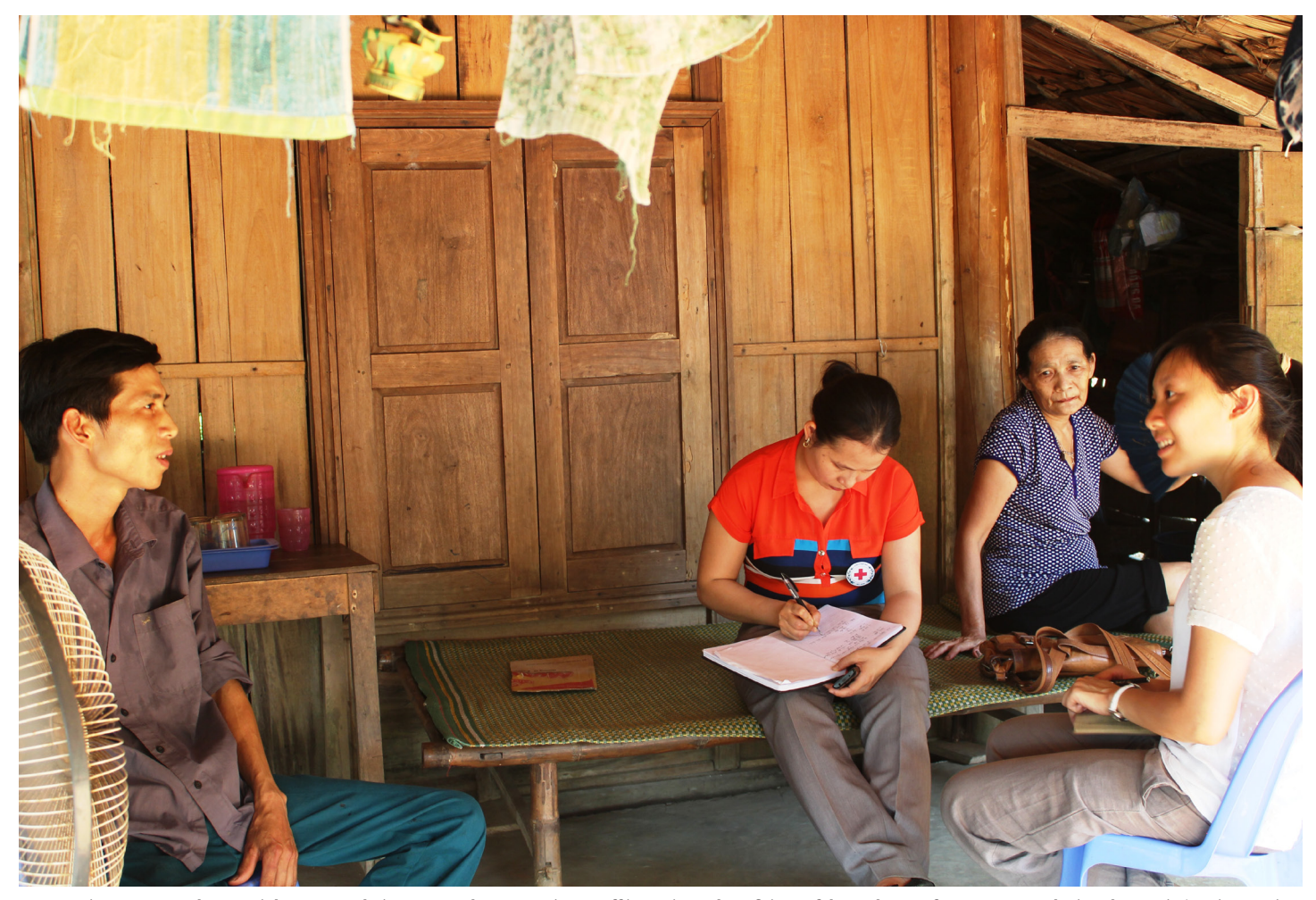
Huong Giang, Huong Khe, Ha Tinh. IFRC and Viet Nam Red Cross Society staff interview a beneficiary of the cash transfer programme during the Wutip/Nari operation, regarding their experience. May 2015

The results fed into the development of information, education and communication materials ready to be disseminated to local areas in preparation for the upcoming disaster season. In addition, the work drew out community feedback on the appropriate mechanisms to engage the community in the beneficiary selection process.