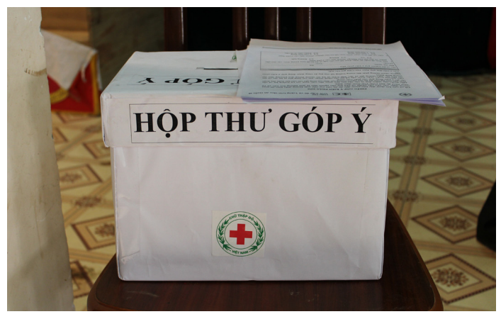
Feedback box at the distribution point in Quang Binh, Viet Nam November 2013

With support from the IFRC, the Viet Nam Red Cross Society developed posters displaying the objectives of the cash transfer programme, the cash grant values, beneficiary selection criteria and selection process, and the hotline phone numbers in case of any questions or concerns. On the day of the cash grants distribution, the posters were displayed at the distribution point, along with the list of beneficiaries and the amount for each family. The phone hotline was complemented by a feedback box and form.