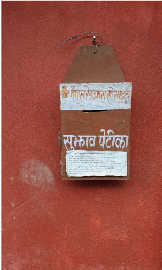
Figure 3 – Feedback box: Sindhupalchok

This underlines the importance of not just establishing feedback mechanisms and promoting them to communities, but also the need to continually evaluate their usage and effectiveness with affected communities and to also understand why communities use certain feedback mechanism and not others, as practiced in the SURE program.